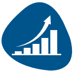
High Growth Enterprises

(Social Enterprises with a focus on creating youth targeted entrepreneurial opportunities)